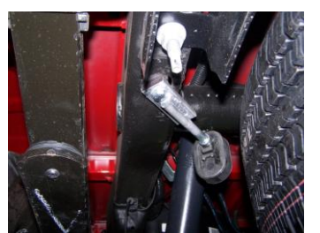
5. Install metal hanger #H into hole located approximately 16" from the rear of the frame. Use hardware kit #I, washer #M, and rubber grommet #J.

8. Install exit pipes #E onto tailpipes. Cut to your preferred length then use clamps to secure exit pipes to tailpipes.