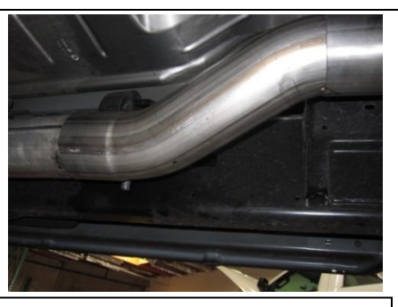
2.Install headpipe #A onto your factory pipe using clamp #G insert welded hanger into the rubber grommet leave clamp loose.

1. Disconnect the negative battery cable before removal of the OEM Exhaust. This will allow the computer to reset and recognize the new exhaust. Lay out the exhaust on the floor so it looks like the drawing and compare parts with manual. Remove the factory exhaust by cutting behind the factory muffler. Once the tail pipe has been removed un-bolt the muffler and head pipe at the clamp located in front of the factory muffler. Use wd-40 or another type of penetrating oil to remove the rubber grommets. Do not damage these they will be re used.