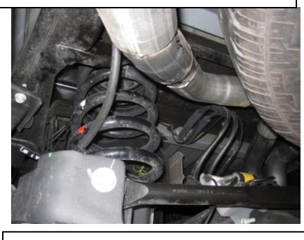
4.Next install Drivers side overaxle tailpipe #C into muffler 1.5" to 2" use clamp #F to secure pipe to muffler do not tighten