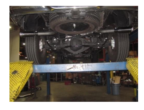
7. Install exit pipes #E onto tailpipes use clamp # F to secure together. After everything is installed begin to tighten all connections starting from the furthest forward connection. Items will move as you tighten. Be sure to check all clearance.

"MAKE SURE YOU HAVE A 1" CLEARANCE ON ALL PIPES FROM ALL RUBBER BRAKE LINES, SHOCK BOOTS, TIRES, ETC..." TORQUE ALL CLAMPS TO APPROX. 100 TO 150 FT LBS.