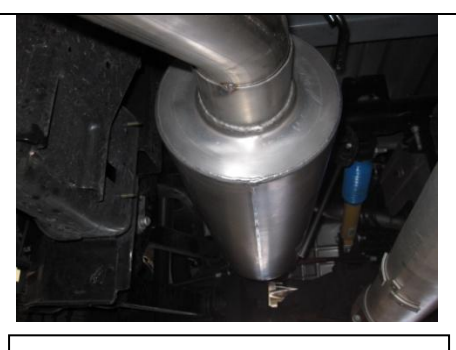
3. Install muffler #B onto headpipe 1.5" to 2" muffler outlets should be on top and level use clamp #G to secure together. Do not tighten. Insert hangers into rubber grommets