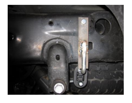
5. Next install drivers side rear hanger and grommet with bolt kit on the outside of the driver side frame rail. Use the factory drilled hole just forward of the large hole seen in the photo above.