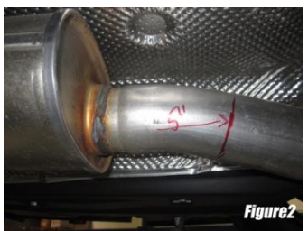
Figure 2: measure 5" inches from behind the passenger side muffler and cut