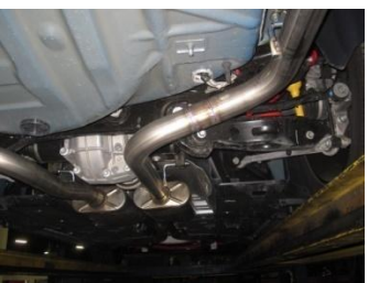
5. Install driver side tailpipe/ dual tip assembly #B. Insert all grommets. Secure tailpipes with clamp #D. Do not tighten

Figure 2: measure 5" inches from behind the passenger side muffler and cut