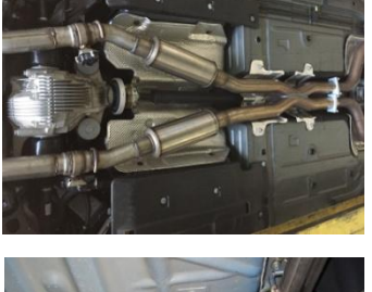
4. Install X pipe assembly #A assembly on to your front factory pipes and secure with factory clamps. Re-install factory cross member. Use a jack stand to support mufflers. Do not tighten. Install valves with supplied clamps Do not tighten

3. once you have removed the factory exhaust you will need to cut off the factory butterfly valves at specific locations. Figure 1: measure 6" inches from behind the driver's side muffler and cut