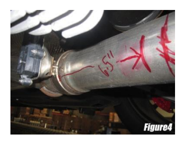
Figure 4: measure 6.5" inches from behind the passenger side valve and cut

2. To remove the stock exhaust, first you must remove the factory cross member under the X pipe. Then unbolt and remove driver side tailpipe at the flange. Now unbolt and cut tack welds on factory clamps at the X pipe and carefully remove factory exhaust, save clamps for new exhaust installation. The 2.75" clamps are included in case you can't use the factory clamps. Leave all rubber grommets on hangers. Use WD-40 to help remove hangers.