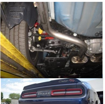
level. 7. Install Gibson Tips. Slip on and adjust to your liking. Inspect all fasteners after 25-50 miles of operation and re-