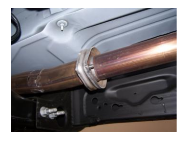
2. To remove stock exhaust, unbolt it at the flange behind the Y-pipe. Make sure to leave all rubber grommets in the factory location. You will reuse stock nuts and bolts. For easier removal of exhaust, cut behind the muffler. Use WD-40 to remove hangers from grommets.

1. Disconnect the negative battery cable before removal of OEM exhaust. This will allow the computer to reset and recognize the new exhaust. Lay out the exhaust on the floor so it looks like the drawing and compare parts with manual.