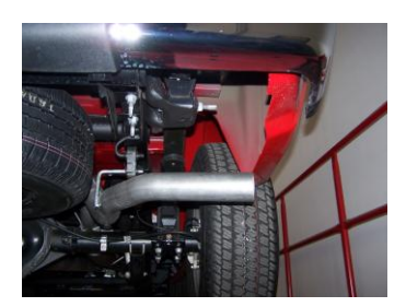
6. Slide exit pipe #D onto overaxle tailpipe using clamp #E to secure. Rotate exit pipe until it is at the correct angle for your truck. Insert welded hanger into rubber grommet.