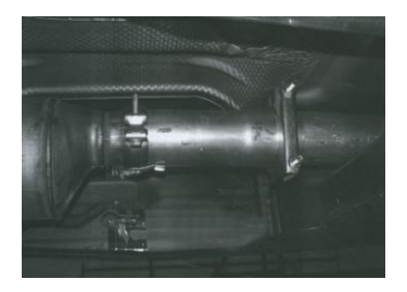
2007/2008 Models Only Bolt headpipe #A to the stock flange re-using the factory nuts and bolts. Insert welded hanger into rubber grommet. Do not tighten, just make snug.