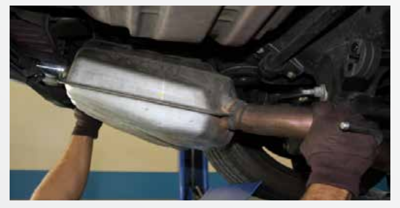
Slide the stock muffler towards the front of the vehicle and remove.