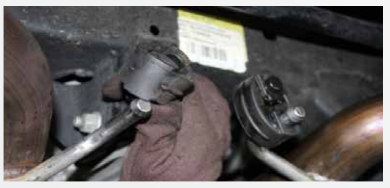
Remove the inner rubber grommets holding the muffler hangers.

NOTE!! Applying WD-40 will aid in removal.