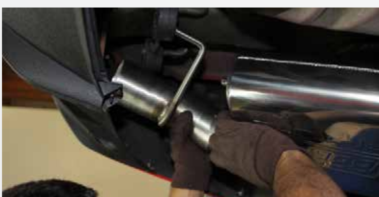
Slide the exit pipe onto the muffler and through the rear hanger grommets, then snug the clamp enough to still allow adjust-ability.