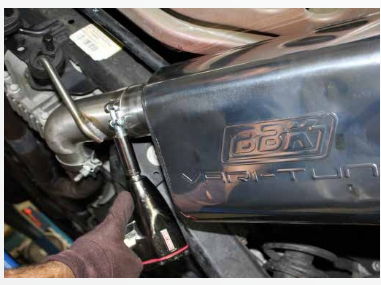
Starting at the inlet pipe clamp adjust the axle back system to your personal preference and tighten the clamps