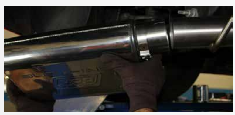
Slide the muffler with the adjuster towards the rear of the vehicle onto the inlet pipe and snug the clamp enough to still allow adjust-ability.