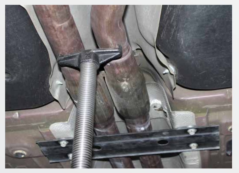
Place a stand underneath the mid pipes to keep them from drooping down.