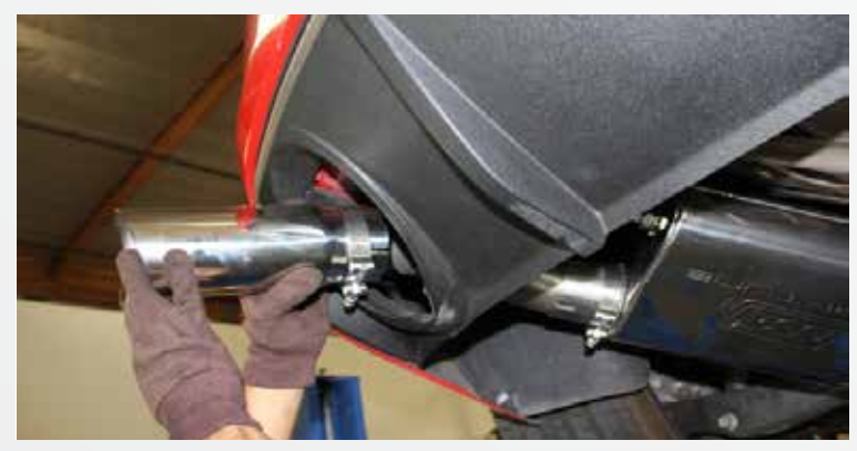
Slide the exhaust tip over the exit pipe and snug the clamp enough to still allow adjust-ability.