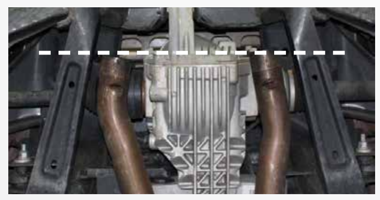
You will need to cut the mufflers from the vehicle using a hack saw or sawsall. Line up your cut with the end of the Rear Differential.