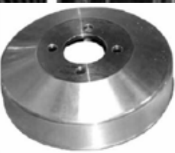
*WATER PUMP PULLEY # MAS176 (APPROX 1996 - 2001)