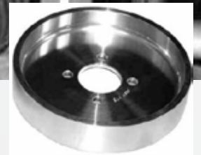
*WATER PUMP PULLEY # MAS178 (APPROX 2001 1/2 - 2004)