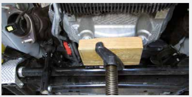
Safely support engine for removal and install motor mounts.