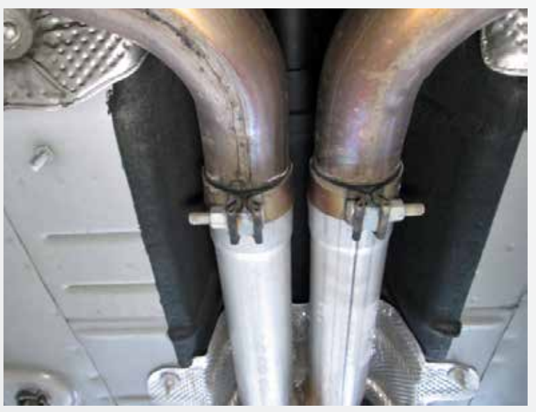
Using 15mm socket disconnect and remove factory head pipes.