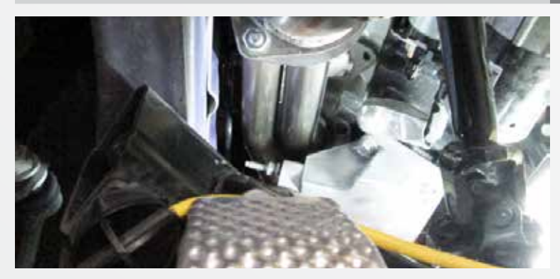
Install BBK headers using supplied hardware and gasket with 10 and 13 mm sockets/wrenches. Re-install motor mount and steering shaft.