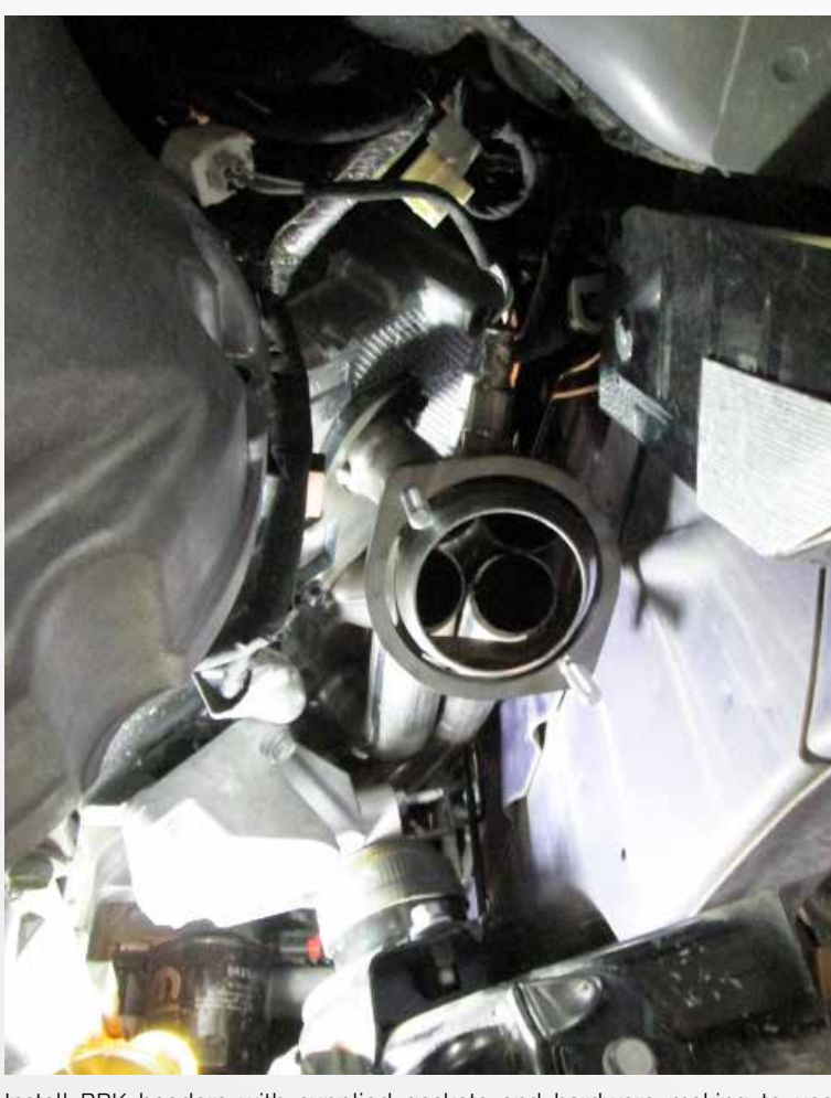
Install BBK headers with supplied gaskets and hardware making to use dipstick bolt and nut. Re-attach alternator brace and install motor mount. Then install factory head pipes. Remove factory \mathrm{O}^2 sensors from manifolds and install them into BBK headers using anti-seize. Install factory plastic shields and start vehicle checking for any leaks. Re-torque all header fasteners the following day after a couple of heat cycles.