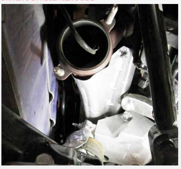
Remove factory head-pipes repeating same step on passenger side.