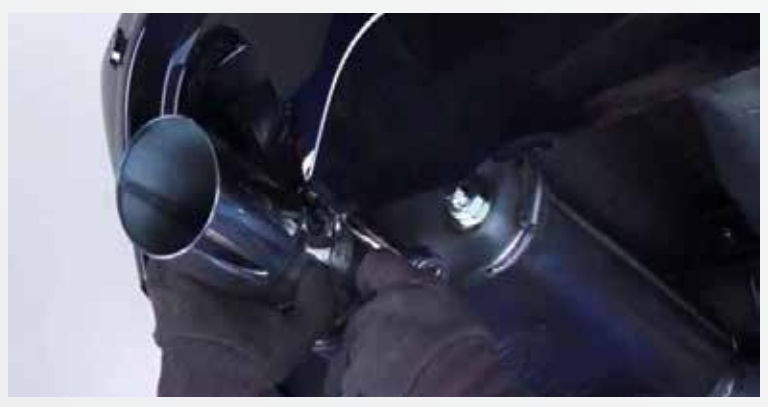
Slide and snug the exhaust tip onto the outlet tube of the muffler.