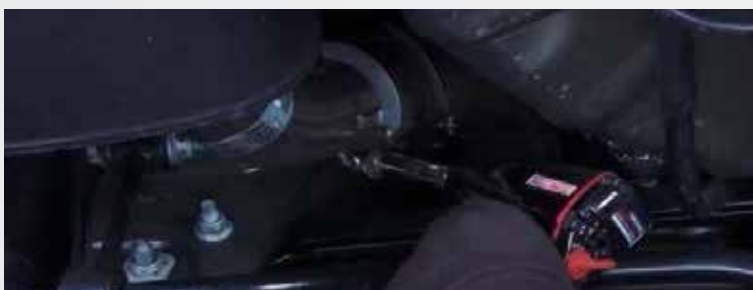
Starting on the driver side, loosen the clamps at the mufflers and mid pipes.