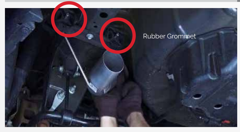
Starting on the driver side, slide the inlet pipe through the 2 hanger grommets and into the mid pipe and snug the clamp to hold the tubing in place.