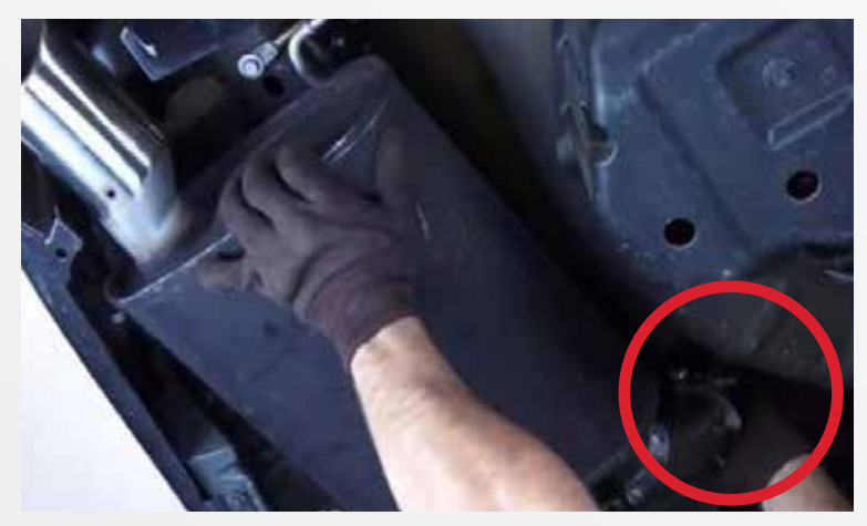
Slide the muffler towards the front of the vehicle and remove.