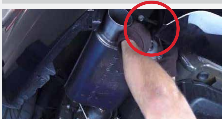
Slide the muffler over the inlet pipe, then slide the grommet closest to the rear bumper onto the muffler hanger.