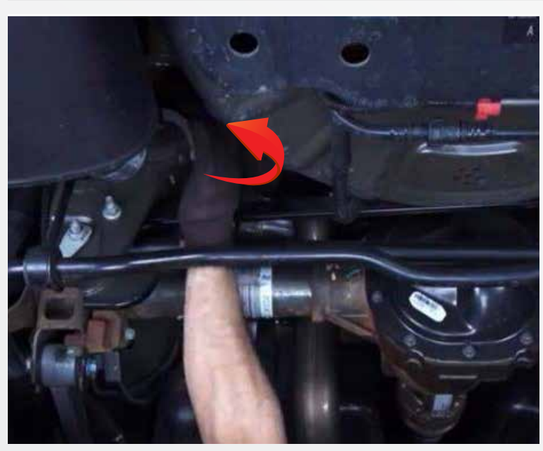
Twist the mid pipe so the muffler has enough clearance to be removed.