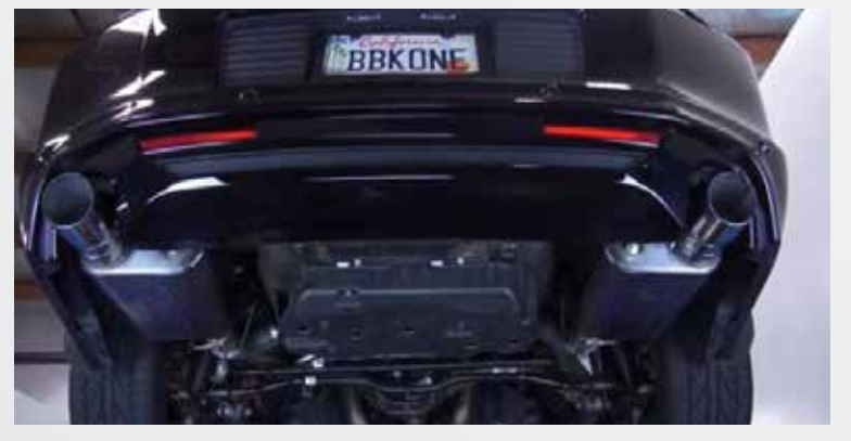
With all the clamps snug, make any fitment adjustments starting at the front clamps on the mid pipe and ending at the muffler tips, then tighten.