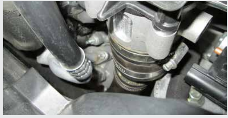
Now reverse all processes installing BBK throttle body, alternator wire, intake tube, chassis cover, etc.

Please Note: See next page for the re-learn procedure.