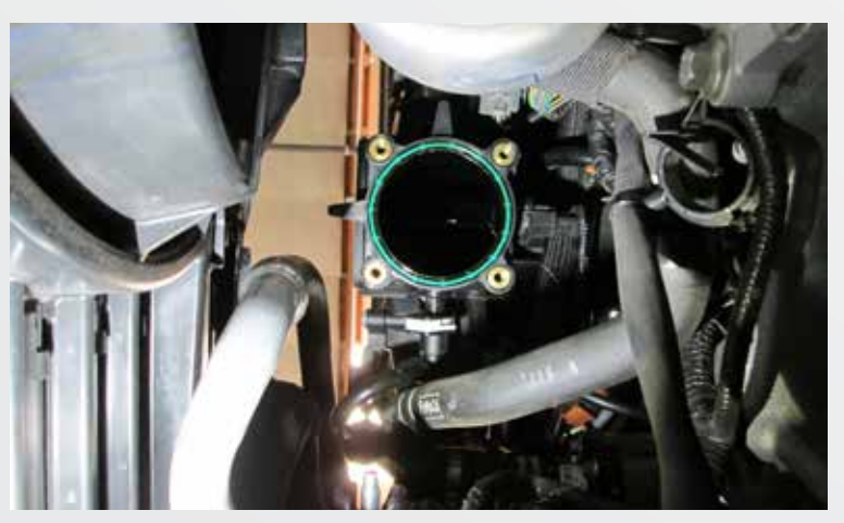
Disconnect signal plug from throttle body then using 8mm socket and extensions remove factory throttle body.