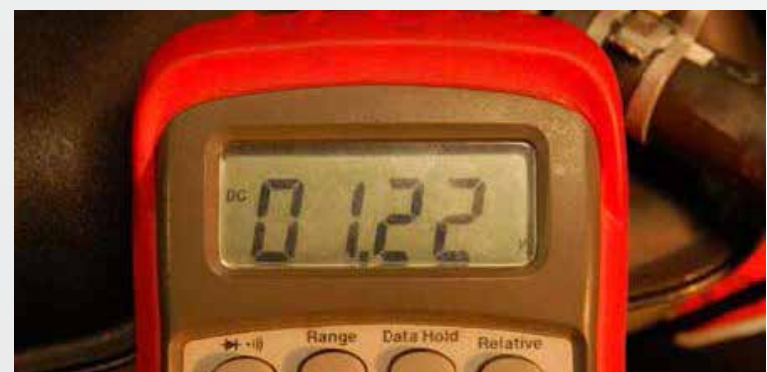
MUSTANG Probe the top wire of the TPS Sensor.