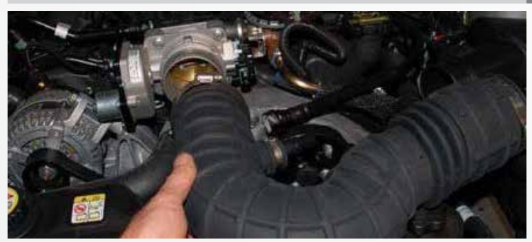
Disconnect the breather tube from the air intake tube. Loosen the clamps at the throttle body and at the air box then remove the air intake tube.