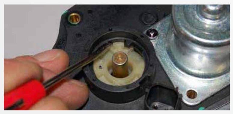
Pop off the round plastic cover on the motor cover. Install the cover on the throttle body. Using a small screwdriver, push the white spring retainer down while rotating it 160 degrees counter clockwise until the large and small tabs align with their slots. Release and allow the tabs to seat.

Install the internal spring on the gear in the BBK Throttle Body. Make sure the hook on the end of the spring is in its mounting hole in the gear.