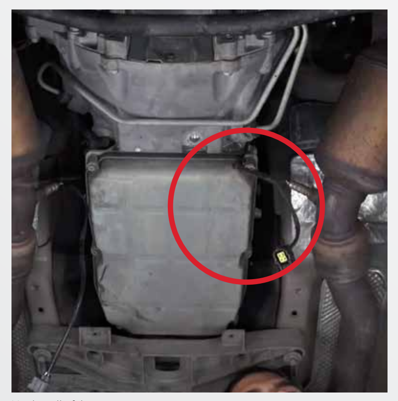
Unplug all of the oxygen sensors.