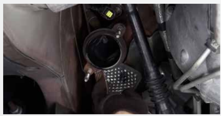
Remove the heat shields from the motor mounts and the factory exhaust manifolds.