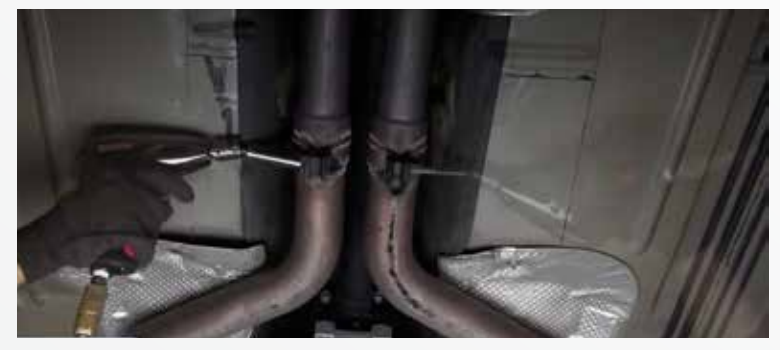
Remove the nuts that attach the H-Pipe to the factory manifolds.