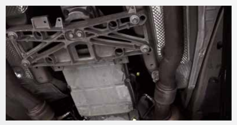
Plug in all of the oxygen sensors.