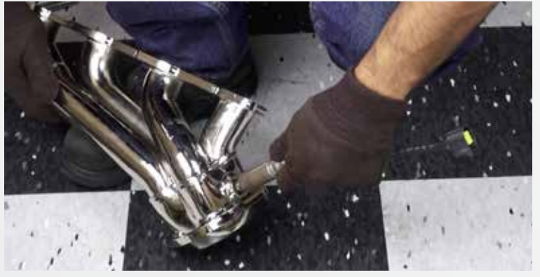
Transfer the oxygen sensors from the factory exhaust manifolds to the BBK Parts.

NOTE!!! Be sure to add a small amount of anti-seize to the top thread of each oxygen sensor using the supplied anti-seize packet. As you thread the oxygen sensor back into the part the anti-seize will spread evenly throughout the threads.