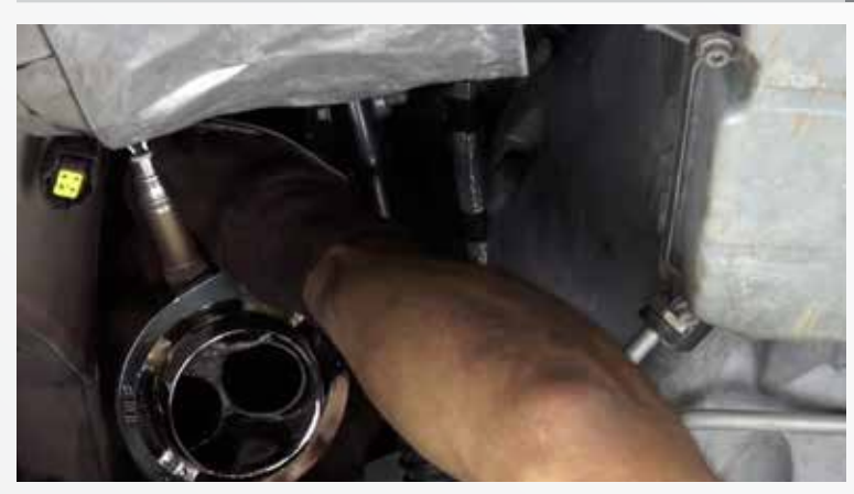
Install the BBK headers by sliding the slots onto the started bolts (over the gaskets) then inserting and tightening all of the supplied header bolts.