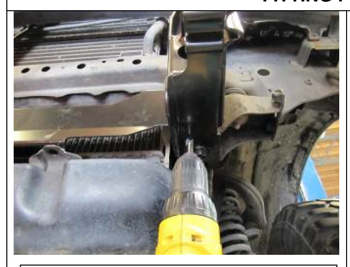
Warning: Drilling operations can result in flying metal debris, safety glasses should be