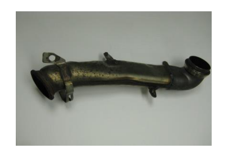
Stock Down Pipe Figure 6