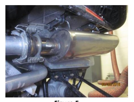
Figure 5 AT-9706PT © 09/24