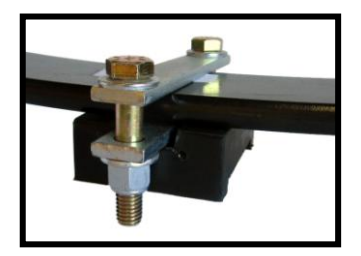
P3KT Ford F250/350 2011-present