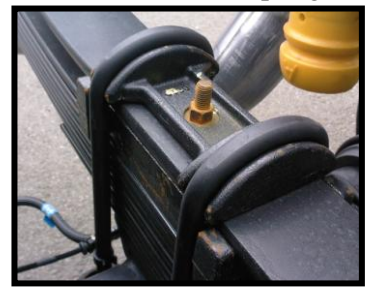
2011~present Ford spring