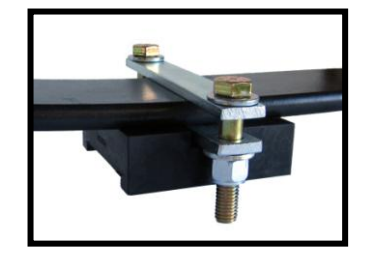
P5KT Ford F450/550 all models