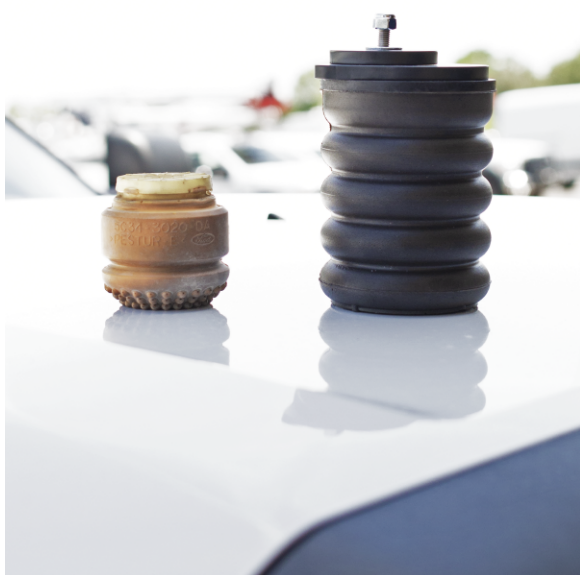
STOCK BUMPSTOP VS. SUMOSPRINGS