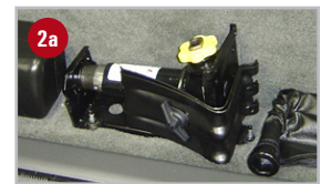
Remove wheel blocks from jack, then loosen jack.