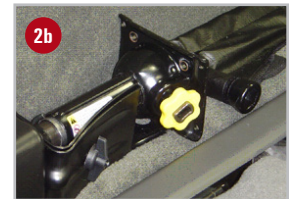
Rotate jack so yellow knob faces outward (as pictured).