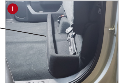
Factory Storage Tray