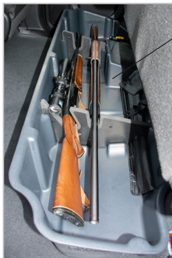
2 shotguns or rifles, 1 with scope, will fit in the gun rack, as pictured.

Warning: Seat bottom must be down at all times while vehicle is moving. Make sure the DU-HA is secured in the vehicle according to installation instructions. Do not store explosives or hazardous materials in the DU-HA. Do not place loaded guns in the DU-HA. For further instructions refer to truck owners manual or contact DU-HA, Inc.