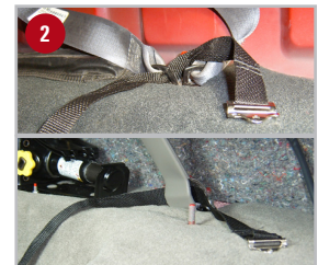
Photo shows two models of seat belt brackets, straps should loop through.