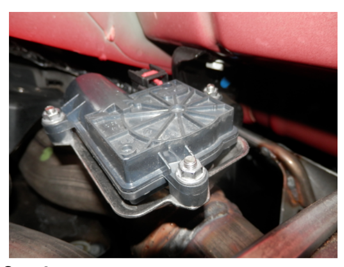
Step 3. Once the OEM system has been removed undo three nuts attaching each exhaust valve motor to the valve and remove.