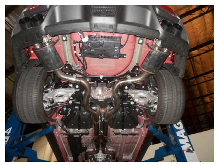
Step 7. Loosely install the Muffler Assemblies using the supplied clamp. Attach the welded hangers to the rubber insulators. Re-attach both electrical connectors to the exhaust valve motors.