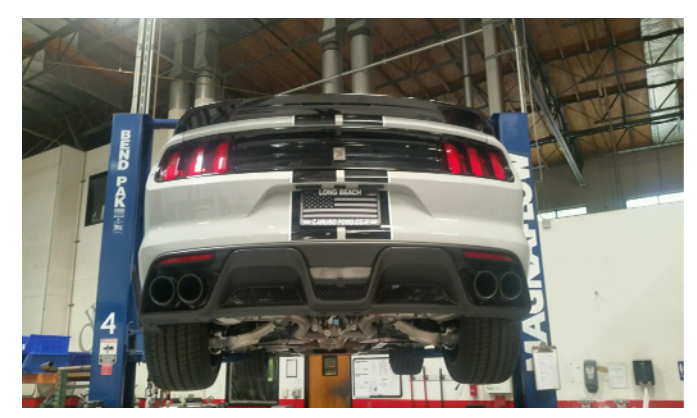
Step 8. Once a final position has been chosen for the new exhaust system, evenly tighten all clamps from front to rear using the torque specifications on page one of the instructions. Inspect all fasteners after 25-50 miles of operation and re-tighten if necessary.