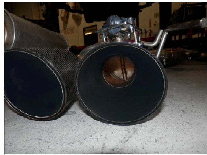
Step 4. Before installing your new exhaust system attach the OEM valve motors to each valve using the supplied M5 hardware. The alignment spring on the motor will need to be engaged into the keyway slot of the new valves.