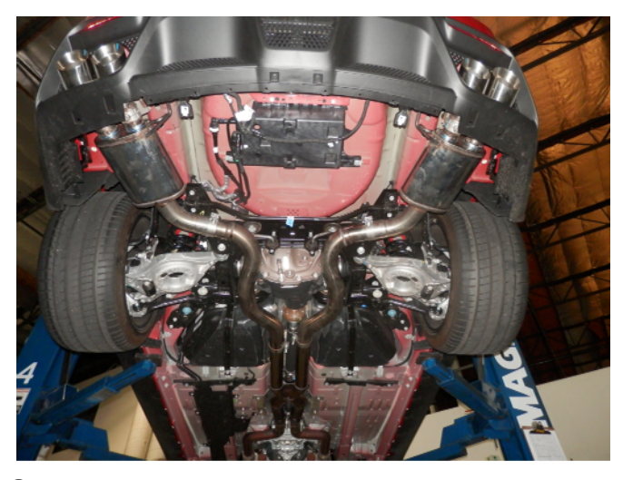
Step 7. Loosely install the Muffler Assemblies using the supplied clamp. Attach the welded hangers to the rubber insulators. Re-attach both electrical connectors to the exhaust valve motors.