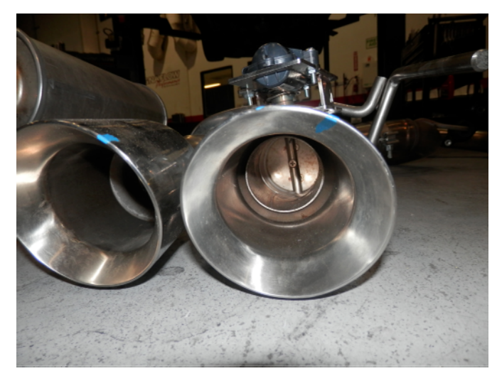
Step 4. Before installing your new exhasut system attach the OEM valve motors to each valve using the supplied M5 hardware. The alignment spring on the motor will need to be engaged into the keyway slot of the new valves.