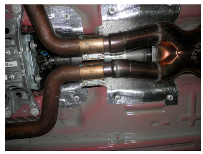
Step 5. Install the X-Pipe Assembly to the OEM slip clamp. Engage the welded hangers to the rubber insulators. Leave all clamps loose for final adjustment of the system.