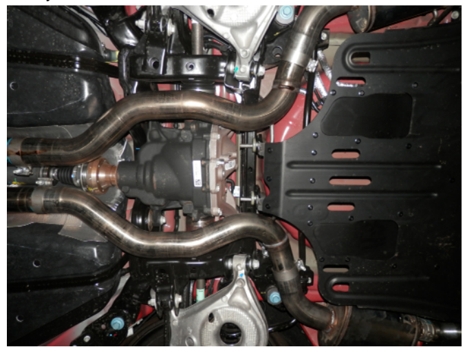
Step 6. Attach both Over Axle Pipes to the X-Pipe Assembly using the supplied clamps. Engage the welded hangers to the rubber insulators.