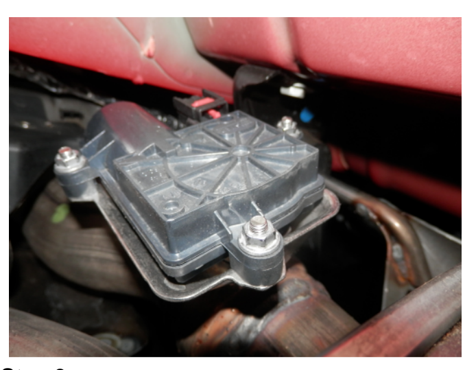
Step 3. Once the OEM system has been removed undo three nuts attaching each exhaust valve motor to the valve and remove.