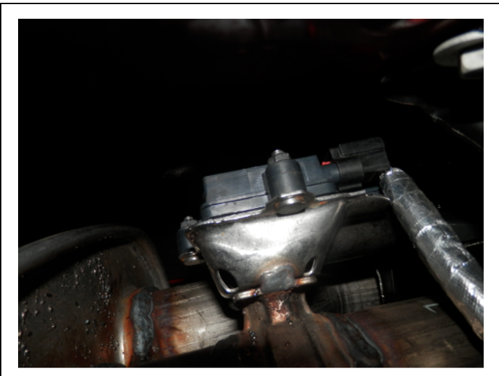
Step 1. To remove the OEM exhaust system you will first need to unplug the exhaust valve control motors located on the OEM muffler assembly.