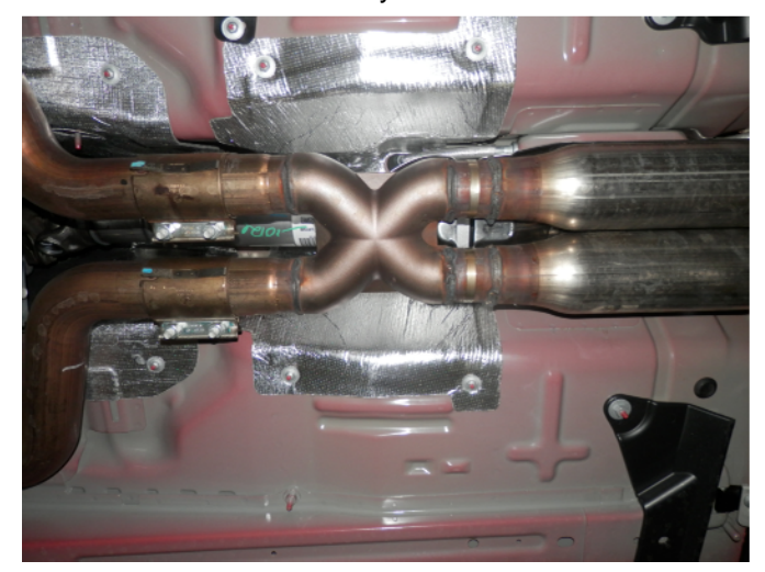
Step 2. Next loosen the clamps at the vehicles catalytic converter outlet pipes. Working from front to rear disengage all welded hangers from the rubber insulators. Retain all mounting hardware as it will be needed to mount your new MAGNAFLOW system.