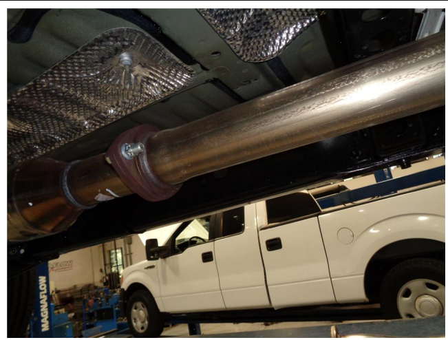
Step 1. Begin removal of the OE system by unfastening the flange attaching the exhaust to the catalytic converter. Do not discard or damage the OE fasteners or rubber insulators as they will be used to install the new system.