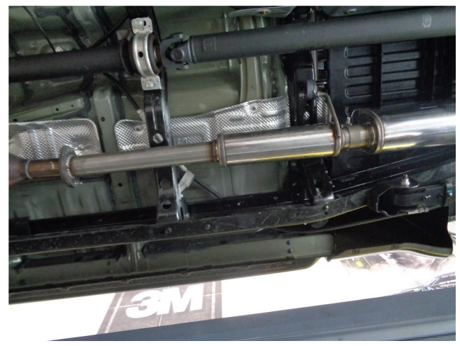
Step 3. Begin installation of your new MAGNAFLOW system by attaching the Inlet Pipe Assembly to the catalytic converter outlet using the OEM fasteners and insulator. Keep all fasteners and clamps loose until final adjustment.