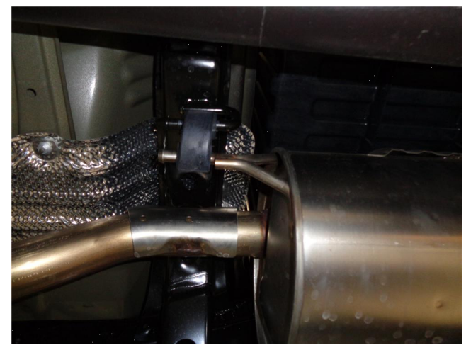
Step 2. Disengage hangers from rubber insulators and remove the OEM exhaust.