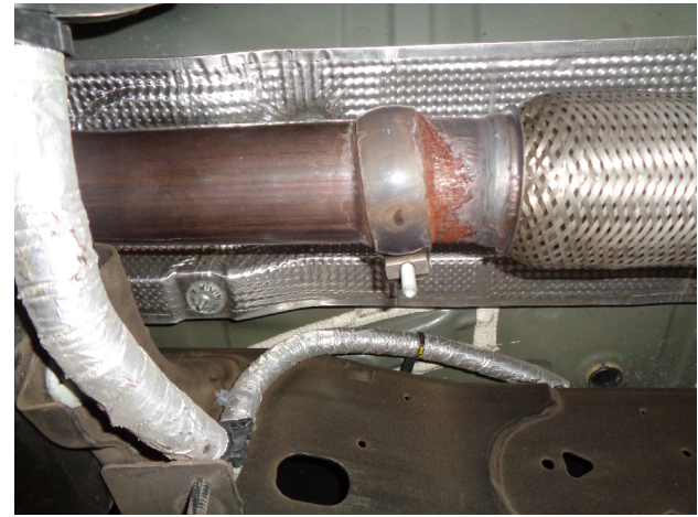
Step 1. To remove the OEM exhaust system, you will to need to cut the between the muffler and the Y junction where it goes over the axle. You can then disengage the welded hangers from the rubber insulators and remove the tailpipe assy. Unfasten the clamp attaching the OEM inlet pipe assembly to the catalytic converter. Do not damage or discard the inlet pipe clamp or rubber insulators as they will be re-used to mount the new system. Disengage the inlet pipe assembly hanger and remove the exhaust from the vehicle.