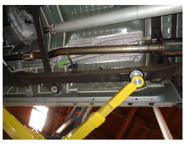
Step 3. Only the Crew Cab Long Bed configuration will require the supplied 12.5 Extension Pipe, Install this to Inlet Pipe Assembly if required using the supplied 3.00" clamp then attach the Muffler Assembly to the Extension Pipe. If the 12.5" Extension Pipe isn't used attach the Muffler Assembly directly to the Inlet Assembly with a supplied 3.00" clamp.