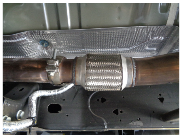
Step 2. To begin, fasten the Inlet pipe assembly to the outlet of the OE system using the OE clamp assembly and by fitting the welded hanger into the rubber insulator (Leave all clamps and fasteners loose for final adjustment of the complete system.)