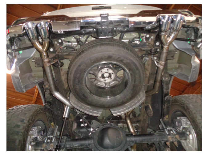
Step 5. Complete the installation by attaching both Tailpipe Assemblies to the Y-Pipe Assembly using the Supplied 2.50" clamps.