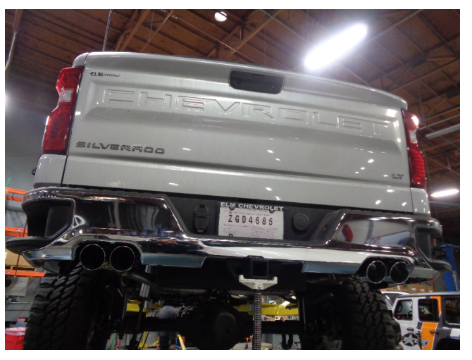
Step 6. Once a final position has been chosen for the new exhaust system, evenly tighten all clamps from front to rear using the torque specifications on page one of the instructions. Inspect all fasteners after 25-50 miles of operation and re-tighten if necessary.