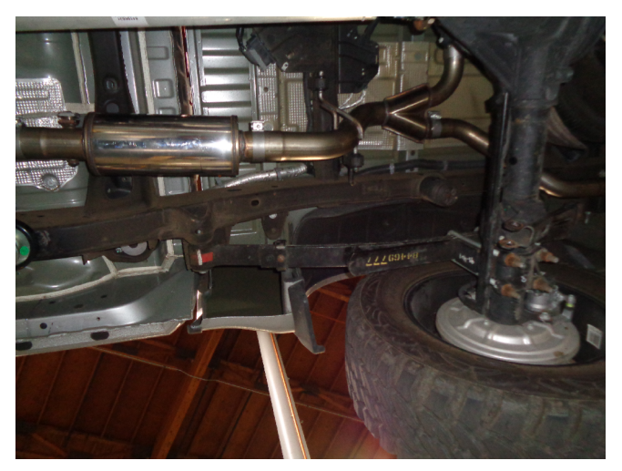
Step 4. Next loosely attach the Y-Pipe Assembly to the Muffler Assembly using the supplied clamp. Engage the welded hangers to the rubber insulators.