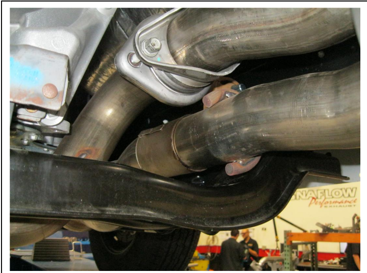
Step 1. To remove the OEM exhaust system, unbolt the flange and clamp attaching the systems inlet pipes to the catalytic converter outlet pipes. Disengage all welded hangers from the OEM rubber insulators. Do not discard the OEM fasteners or damage the rubber insulators as they will be needed to mount your new MAGNAFLOW system.