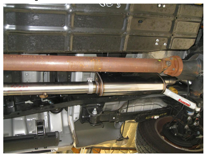
Step 4. Install both the Muffler Assembly and Tail Pipe Assembly using the supplied 3.50" clamps. Locate the welded hangers to the OEM rubber insulators.