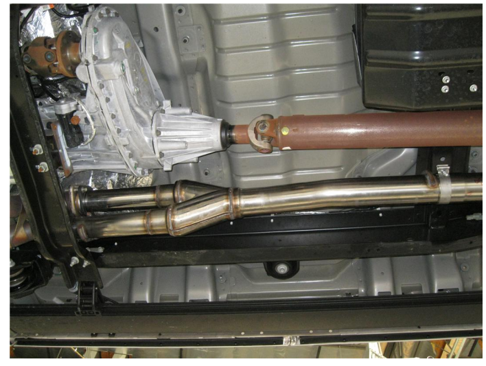
Step 2. Install the new system by attaching the Inlet Y-Pipe Assembly to the OEM catalytic converter outlet pipes using the existing clamp and hardware. Locate the welded hanger to the rubber insulator. Leave all clamps and fasteners loose for final adjustment of the complete system once installed.