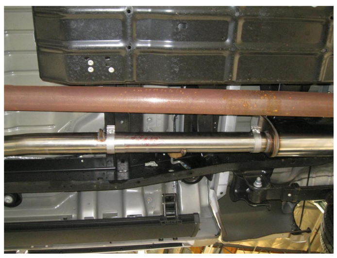
Step 3. Install the Mid Pipe Extension Assembly using the supplied 3.50" clamp. Use the supplied 19.25" Extension Pipe between the Inlet Y-Pipe Assembly and the Mid Pipe Extension Assembly if your truck has a long bed configuration.