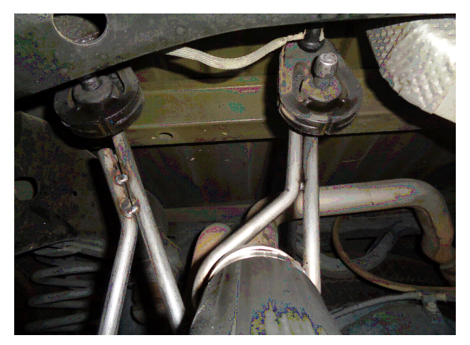
Step 3: insert the welded hangers into the rubber insulators

Step 1. Begin removal of the OE muffler by loosening the two clamps attaching the oe Muffler Assembly. Disengage the hangers from the rubber insulators and remove the muffler. Do not discard or damage the rubber insulators or rear clamp as they will be used to install the new system.