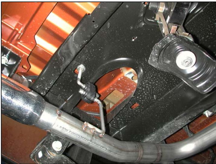
FIG. 2 - Driver's side

Warning: When working on, under, or around any vehicle exercise caution. Please allow the vehicle's exhaust system to cool before removal, as exhaust system temperatures may cause severe burns. If working without a lift, always consult vehicle manual for correct lifting specifications. Always wear safety glasses and ensure a safe work area. Serious injury or death could occur if safety measures are not followed.