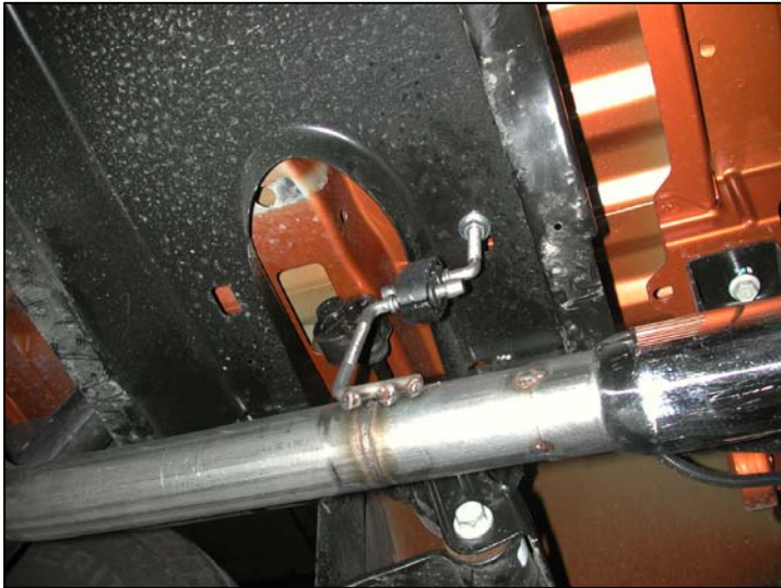
FIG. 1 - Passenger's side