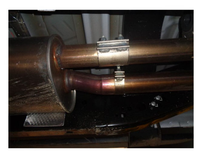
Step 2. Next loosen both band clamps attaching the rear muffler subassembly to the inlet muffler assembly. Disengage all welded hangers from the rubber insulators. The muffler subassembly may now be removed.