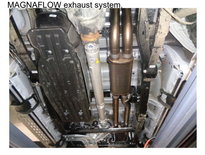
Step 4. Install the Muffler Assembly by attaching the inlet nipples to the outlets of both Inlet Pipe Assemblies. Loosely secure using the supplied clamps. Engage the welded hanger to the rubber insulator.