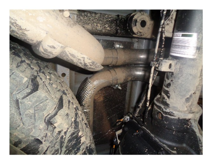
Step 1. Begin removal of the OEM exhaust system by loosening the band clamps attaching the tail pipe assemblies to the over axle pipes. Disengage all welded hangers from the rubber insulators and remove both tail pipes. Retain all mounting hardware as it will be used to install your new system.