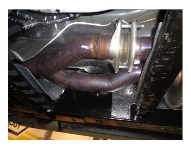
Step 3. Finally remove the OEM inlet muffler assembly by unbolting the inlet at the driver side flange junction and loosening the band clamp on the passenger side inlet pipe. Remove the inlet muffler asembly. You are now ready to install your new