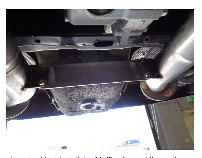
Step 3: Next Install the Muffler Assemblies to the outlets of the Resonator Assembly using the supplied 2.50" clamps. Insert hangers into rubber insulators. At this time loosely attach the Magnaflow logo brace to tie the muffler assemblies together using the supplied fasteners.

MAGNAFLOW: 1901 Corporate Centre Dr - Oceanside, CA 92056 | 1(800)990-0905 Technical Support: 1(800) 959-9226 | Email: moreinfo@magnaflow.com