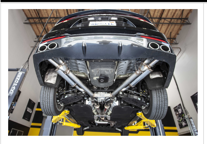
Step 4: Once a final position has been chosen for the new exhaust system, evenly tighten all clamps from front to rear using the torque specifications on page one of these instructions. Tighten fasteners for Muffler brace and install factory underbody brace. Inspect all fasteners after 25-50 miles for operation and re-tighten if necessary.

MAGNAFLOW: 1901 Corporate Centre Dr - Oceanside, CA 92056 | 1(800)990-0905 Technical Support: 1(800) 959-9226 | Email: moreinfo@magnaflow.com