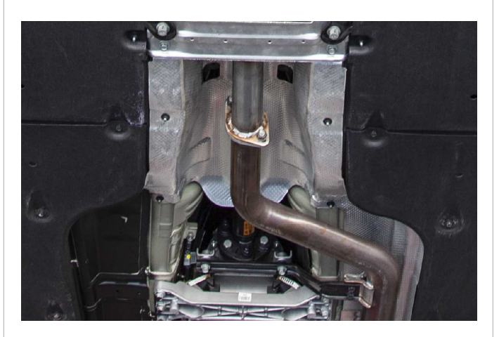
Step 1. To extract the OEM exhaust system you will first need to remove the brace located in front of the factory resonator. Next un-fasten the flanges located behind the catalytic converters and resonator and disengage all welded hangers from the rubber insulators. Do not damage or discard the rubber insulators or fasteners as they will be re-used to mount the new system. You can now remove the exhaust from the vehicle.