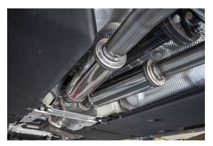
Step 2: Begin installation of the new system by fastening the Resonator Assembly inlet to the flange outlet using the OE fasteners (Leave all clamps and fasteners loose for final adjustment of the complete system.)