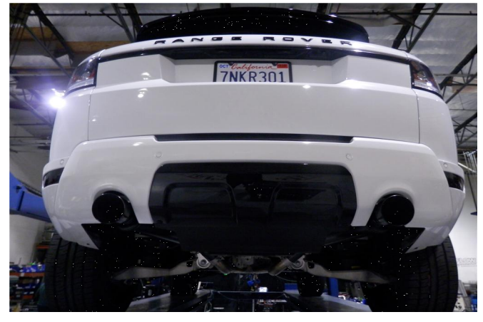
Step 5. Once a final position has been chosen for the new exhaust system, evenly tighten all clamps from front to rear using the torque specifications on page one of the instructions. Inspect all fasteners after 25-50 miles of operation and re-tighten if necessary.