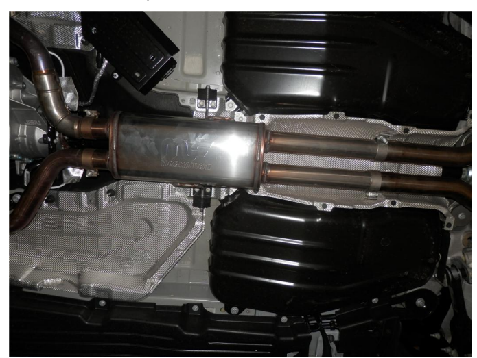
Step 2. Begin installation of your new MAGNAFLOW system by attaching the Inlet Muffler Assembly to the two catalytic converter outlet pipes. Loosely secure using the supplied 2.36" clamps. Fit the hangers into the rubber insualtors. Leave all clamps loose until final adjustment.