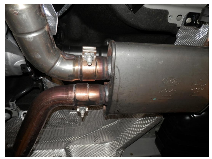
Step 1. Begin removal of the OEM system by unclamping the OEM muffler from the catalytic converter outlet pipes. You can then disengage the welded hangers from the rubber insulators, working rearward finish removing the system. Do not damage or discard the rubber insulators as they will be re-used to mount the new system.