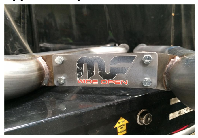
Step.4 Finally install the MF logo Support Bracket to the welded brackets located on the Mid Pipe Assemblies using the supplied hardware.