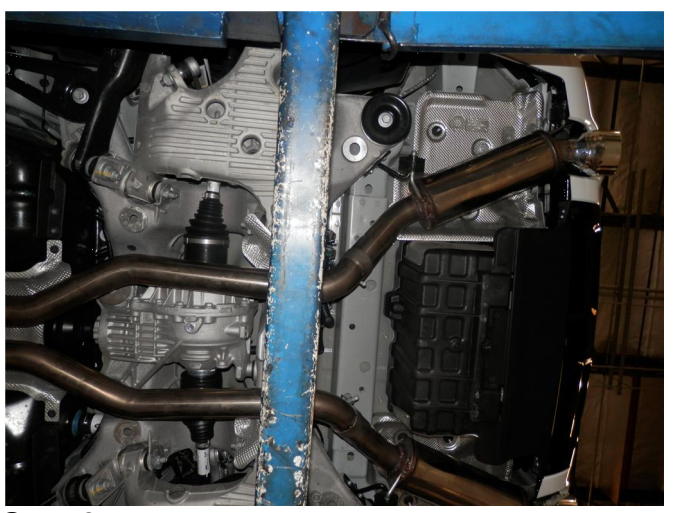
Step 3. Next loosely Install the two Mid Pipe Assemblies and the muffler assemblies using the supplied 2.50" clamps. Engage the welded hangers to the rubber insulators.