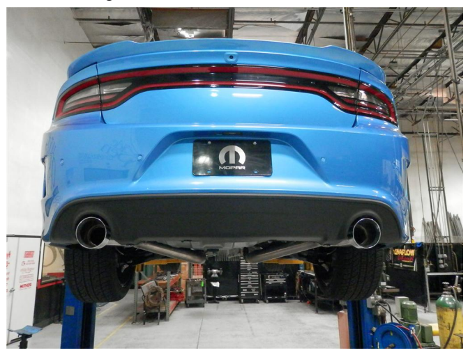
Step 9. Once a final position has been chosen for the new exhaust system, evenly tighten all clamps from front to rear using the torque specifications on page one of the instructions. Inspect all fasteners after 25-50 miles of operation and re-tighten if necessary.