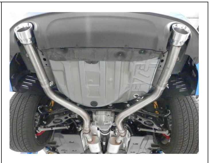
Step 8. Loosely attach each Tail Pipe Assembly to the Mid Pipes using the supplied clamps. Engage the welded hangers for each to the rubber insulators.