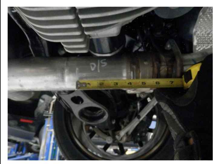
Step 1. Begin removal of the OEM system by cutting both sides of the systems exhaust pipes. Four cuts will need to be made. For the drivers side cut 4" rearward of outlet weld on the exhaust control valve as shown in the attached picture.