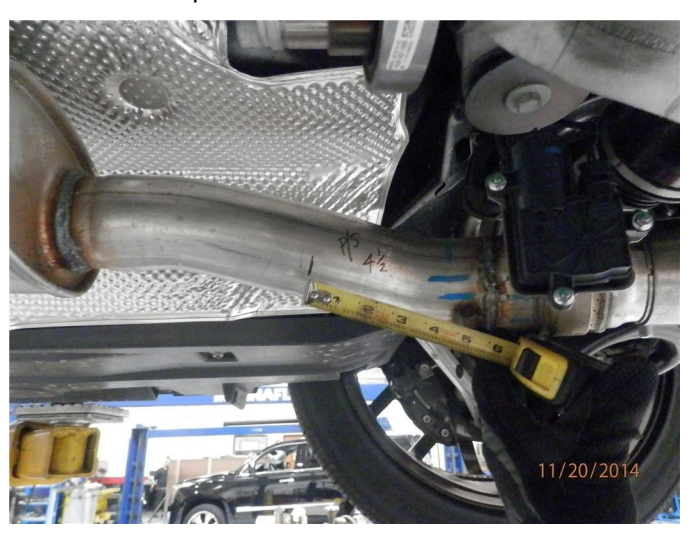
Step 4. For the passengers side cut 4.50" in front of the welded hanger forward of exhaust control valve as shown in the attached picture. With both valve assemblies cut from the OEM system, loosen the band clamps attaching the mufflers to the OEM tips. Both tail pipe sections may now be removed.