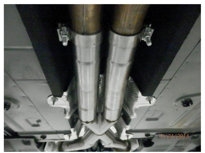
Step 6. Begin installation of the new system by slipping the inlet tubes corresponding with your vehicle. Loosely securing associated clamps provided. Next slip on the X-Pipe Muffler Assembly over the inlet tube adaptors. Loosely secure using two of the suppled 3.00" clamps. Orientation of the Muffler Assembly can be confirmed by the MF logo being "upright" after installation.