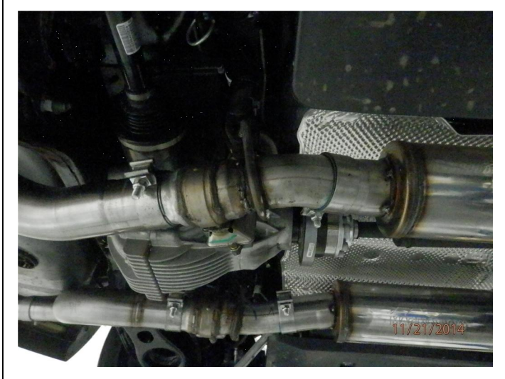
Step 7. Next, loosely fasten the X-Pipe Muffler Assembly outlet pipes to the OEM control valve outlet that you have just cut using the supplied 2.75" clamps. Attach the two Mid Pipes in a similar fashion to the outlet of the control valve.