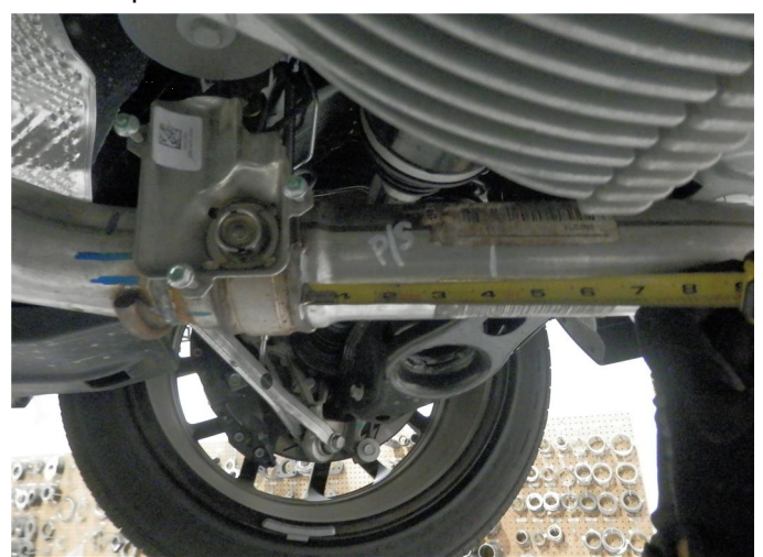
Step 2. For the passengers side cut 4" rearward of the outlet weld on the exhaust control valve as shown in the attached picture.