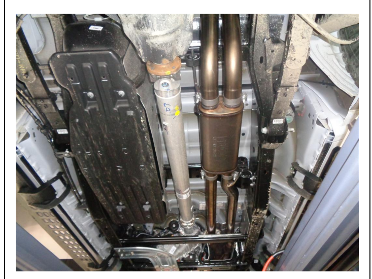
Step 6. Install the Muffler Assembly by attaching the inlet nipples to the outlets of both Inlet Pipe Assemblies(SuperCab) or Extension Pipes (SuperCrew). Loosely secure using the supplied clamps. Engage the welded hanger to the rubber insulator.