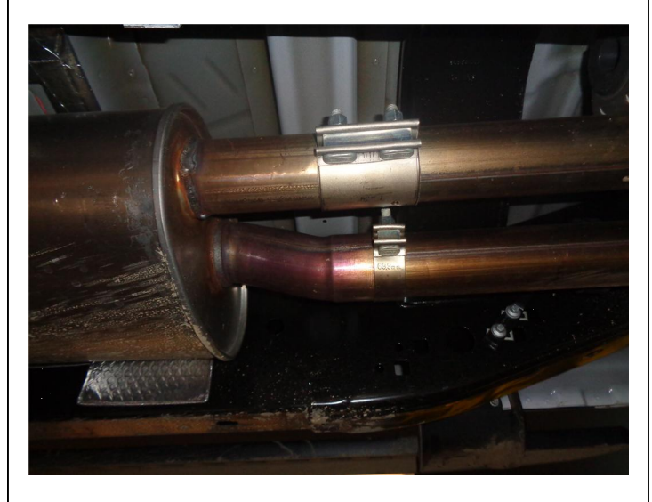
Step 2. Next loosen both band clamps attaching the rear muffler subassembly to the inlet muffler assembly. Disengage all welded hangers from the rubber insulators. The muffler subassembly may now be removed.