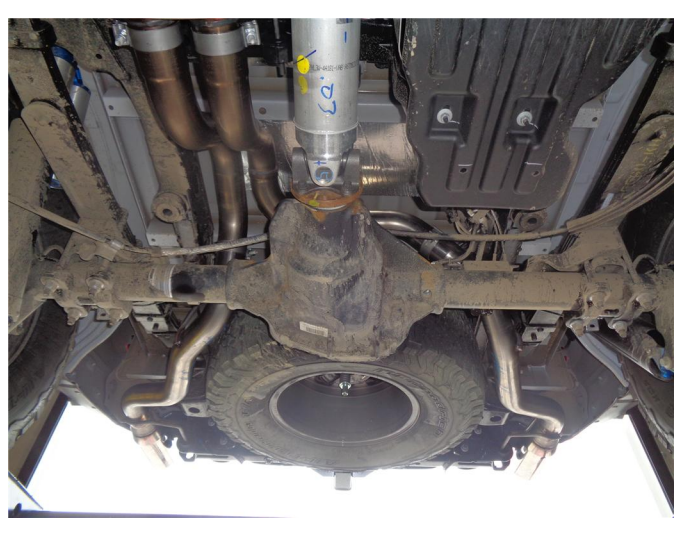
Step 7. Loosely attach both Over Axle Pipes to the Muffler Assembly outlets using the supplied clamps.