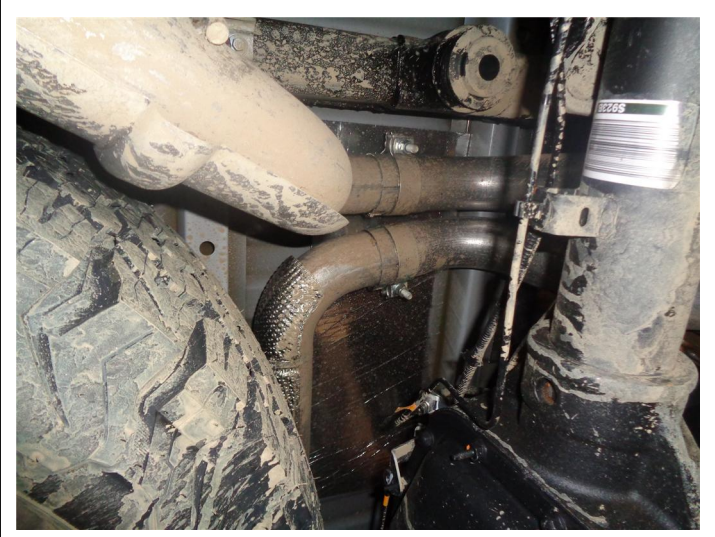
Step 1. Begin removal of the OEM exhaust system by loosening the band clamps attaching the tail pipe assemblies to the over axle pipes. Disengage all welded hangers from the rubber insulators and remove both tail pipes. Retain all mounting hardware as it will be used to install your new system.