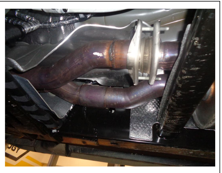
Step 3. Finally remove the OEM inlet muffler assembly by unbolting the inlet at the driver side flange junction and loosening the band clamp on the passenger side inlet pipe. Remove the inlet muffler asembly. You are now ready to install your new MAGNAFLOW exhaust system.