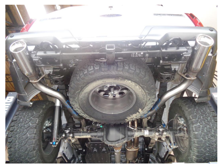
Step 8. Finish by loosely attaching both Tail Pipe Assemblies to the Over Axles Pipes using the supplied clamps. Engage the welded hangers to the rubber insulators.