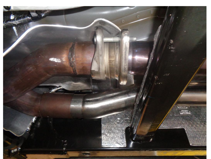
Step 4. - NOTICE - this exhaust kit works with both the SuperCrew and SuperCab models. The SuperCrew has additional parts. Begin the installation by slipping the inlet of the P/S Inlet Pipe Assembly into the OEM band clamp. On the SuperCab model engage the welded hanger into the rubber insulator. Next bolt the D/S Inlet Pipe assembly to the OEM flange junction using the supplied nuts. All clamps and fasteners are to remain loose until final installation.