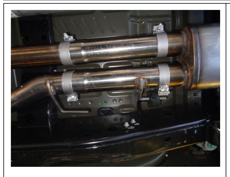
Step 5. FOR THE SUPERCREW ONLY, install both extension pipes into the resonator outlets and engage the hanger into the rubber insulator.