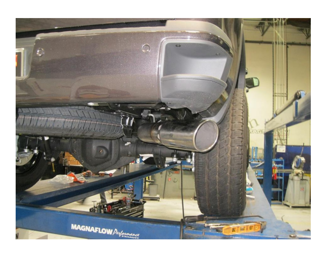
Step 4. Once a final position has been chosen for the new exhaust system, evenly tighten all clamps from front to rear using the torque specifications on page one of the instructions. Inspect all fasteners after 25-50 miles of operation and re-tighten if necessary.