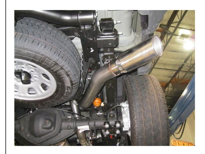
Step 3. Next Install the Tail Pipe Assembly in a similar fashion using the supplied 4.00" clamps and by fitting the welded hanger clamp into the rubber insulators.