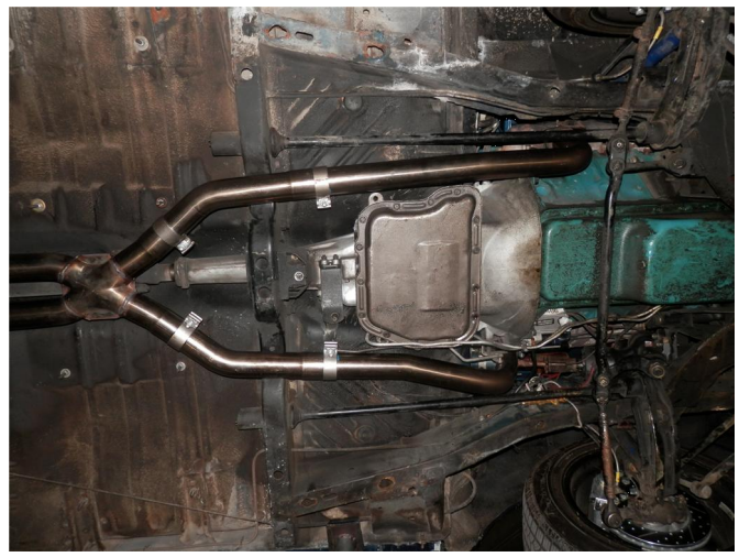
Step 2. Loosely attach the inlet of each Manifold Pipe to the OEM Manifold using the supplied gaskets and hardware. Then attach both Manifold Pipes outlets the the inlet end on Magnaflow System #19303 using the supplied clamps.