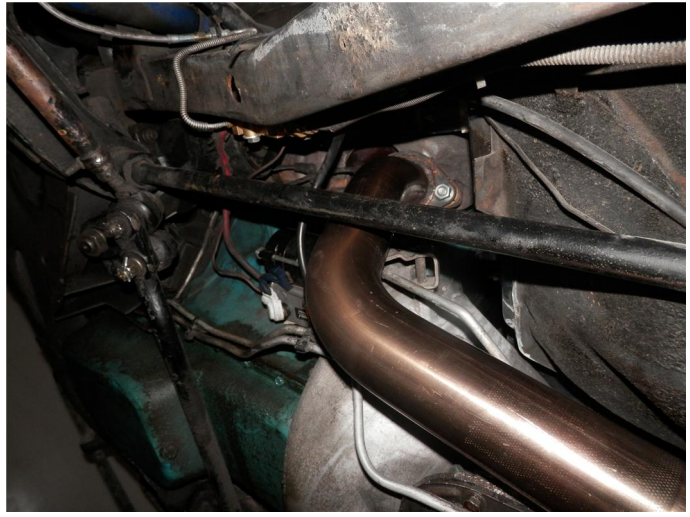
Step 1. This install sheet assumes you have already removed the OEM exhaust system. Identify the drivers side and passengers side Manifold Pipes. Drivers side is shown.

NOTE: This kit is designed to be used with Magnaflow System # 19303. Please check your vehicles correct application at www.magnaflow.com