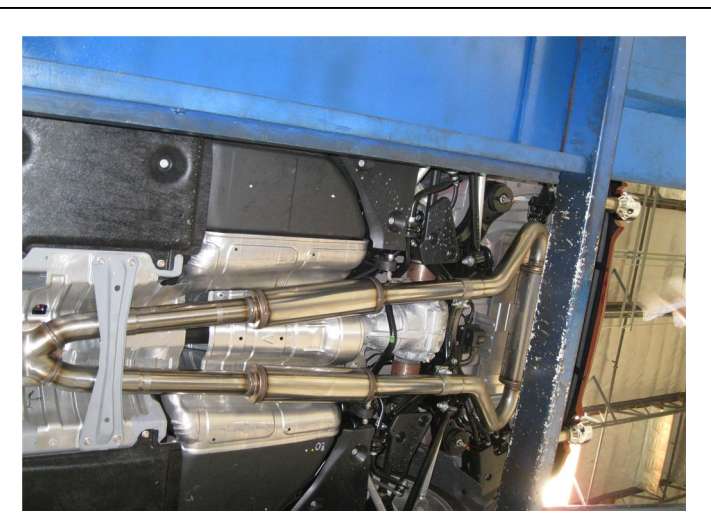
Step 4. Loosely secure the Muffler Assembly and both Tip Assemblies in a similar fashion and reattach the cross brace.