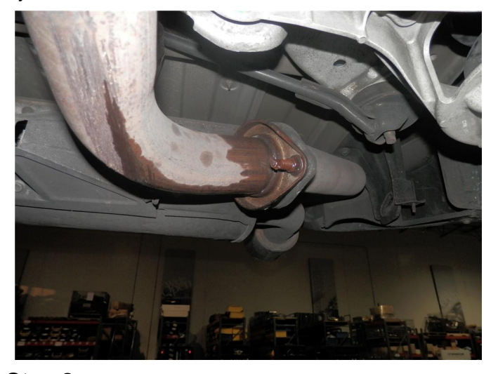
Step 2. Unbolt the flange junction between the mid pipe and the muffler assembly. Unfasten the ground strap from the muffler (this will not be re-attached) and disengage the hangers from rubber insulators. You can now remove the OEM exhaust.