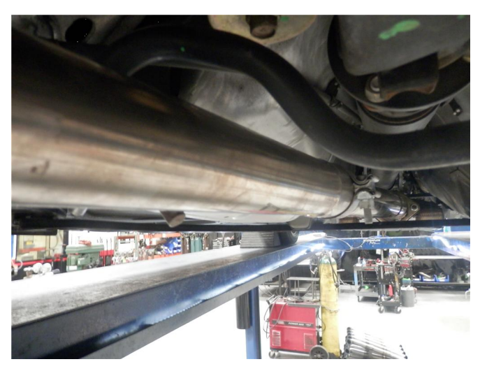
Step 3. Begin installation of your new MAGNAFLOW system by attaching the flanges of the Inlet Pipe Assembly to the catalytic converter outlet using the OEM hardware. Keep all fasteners and clamps loose until final adjustment.