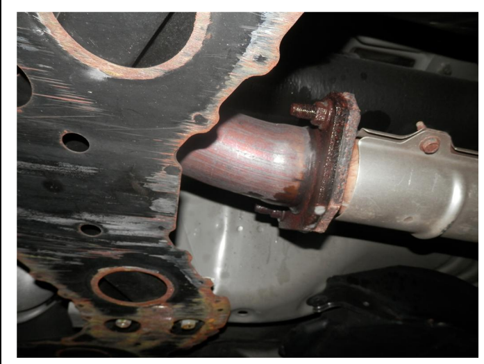
Step 1. Begin removal of the OEM exhaust system by unbolting the flanges attaching the exhaust to the catalytic converter. Do not discard or damage the OEM fasteners or rubber insulators as they will be used to install the new system.