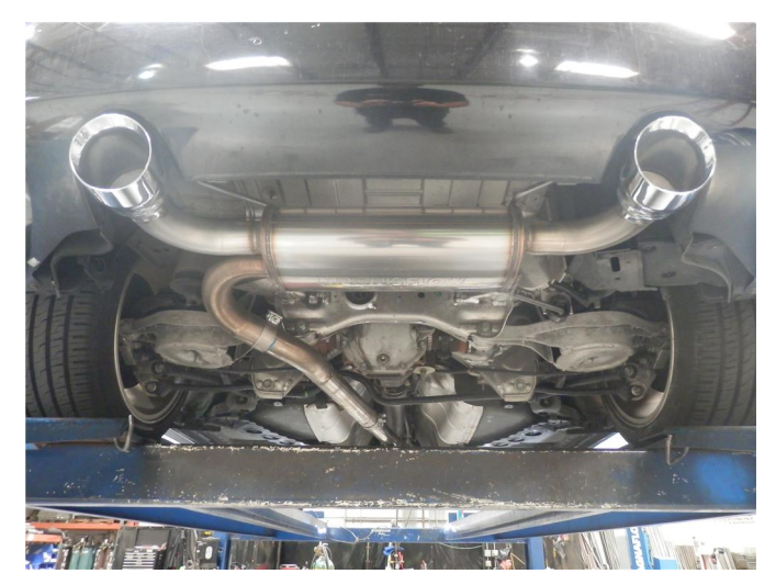
Step 5. Loosely attach the Muffler Assembly to the Mid Pipe Assembly using the supplied clamp. Engage all welded hangers to the rubber insulators.