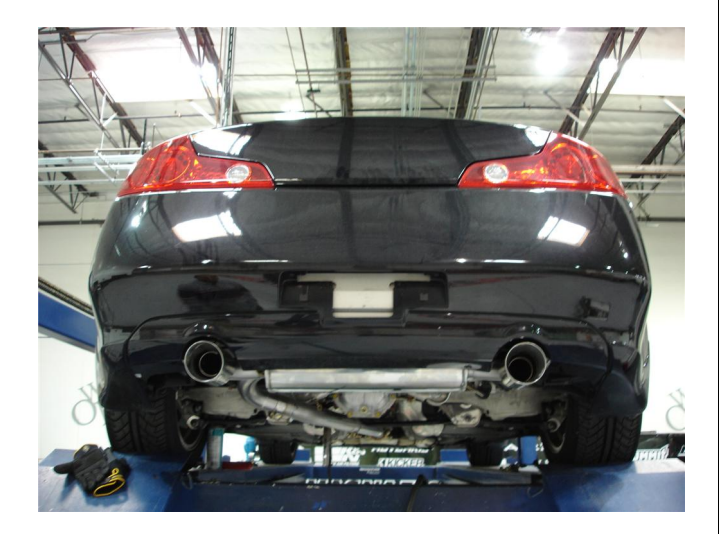
Step 6. Once a final position has been chosen for the new exhaust system, evenly tighten all clamps from front to rear using the torque specifications on page one of the instructions. Inspect all fasteners after 25-50 miles of operation and re-tighten if necessary.