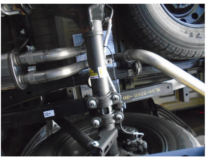
Step 4. Loosely attach both Over Axle Pipes to the Muffler Assembly using the supplied 2.50" clamps.