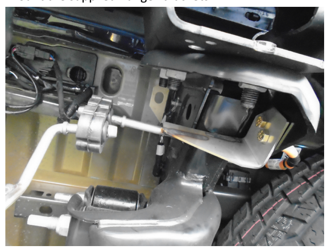
Step 6. Attach both Hanger Bracket Assemblies to the vehicles subframe using the supplied hardware as shown.

Step 5. Towards the rear of the vehicle there are two hole on each side of the subframe. These will be used to mount the supplied hanger brackets.