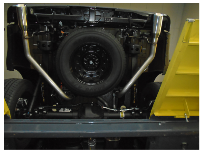
Step 7. Loosely Install both Tail Pipe Assemblies using the supplied 2.50" clamps. Engage the welded hangers to the Hanger Bracket Assemblies using the supplied rubber insulators.