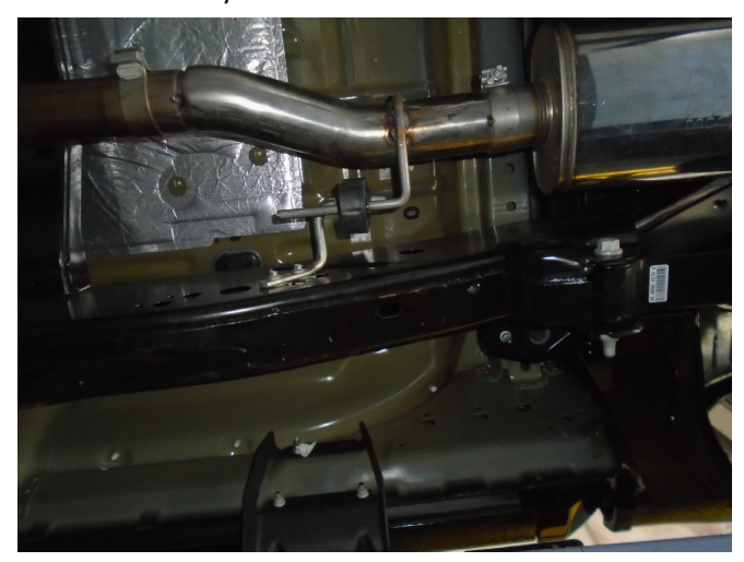
Step 2. Install your new MAGNAFLOW system by loosely attaching the Inlet Pipe Assembly using the OE clamp.