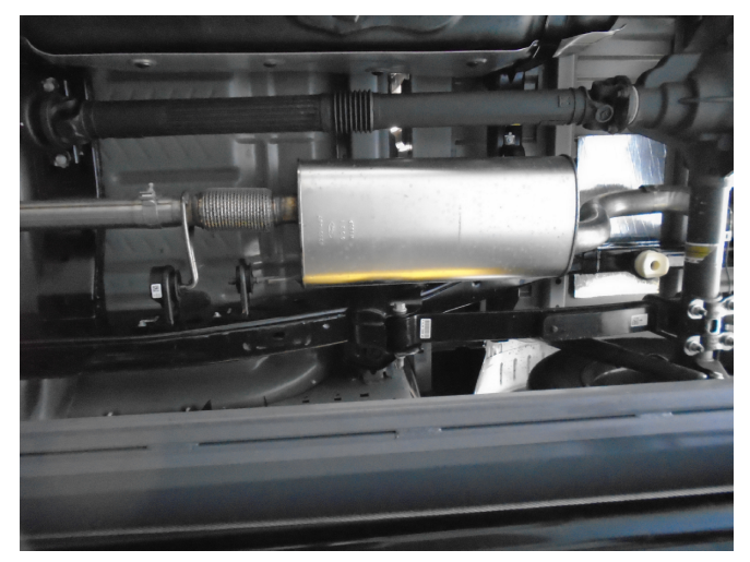
Step 1. To remove the OEM exhaust system, you will need to loosen the clamp behind the OEM muffler. Disengage the welded hangers from the rubber insulators. Remove the OEM exhaust system. Do not damage or discard the OEM fasteners or rubber insulators as they will be resued to mount your new MAGNAFLOW system.