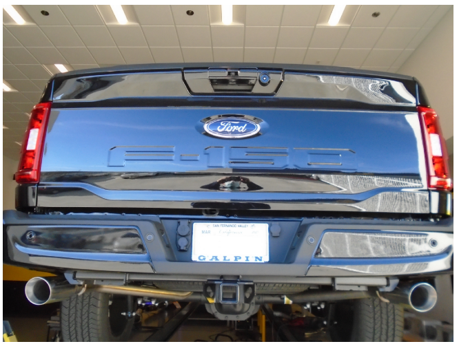
Step 8. Once a final position have been choden for the new exhaust system, evenly tighten all clamps from front to rear using the torque specifications on page one of these instructions. Inspect all fasteners after 25-50 miles if operation and re-tighten if necessary.

MAGNAFLOW: 1901 Corporate Centre Dr - Oceanside, CA 92056 | 1(800)990-0905 Technical Support: 1(800) 959-9226 | Email: moreinfo@magnaflow.com