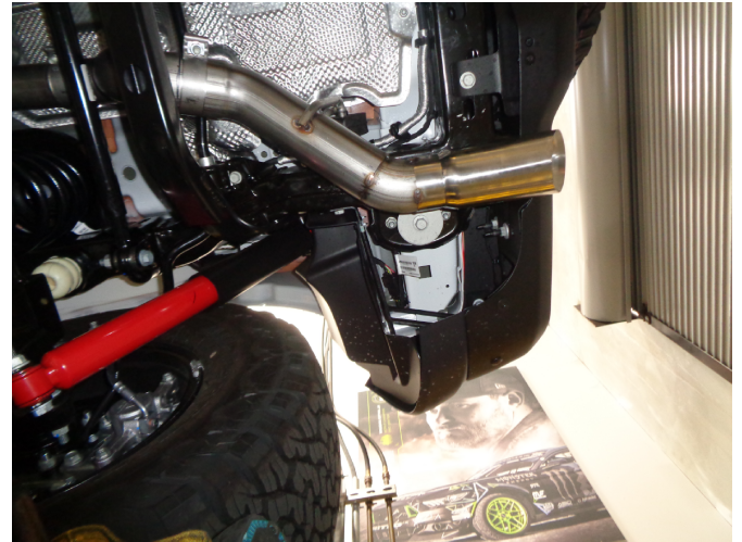
BLACK TAIL PIPE OPTION

Step 3. Your MAGNAFLOW system comes with a choice of a Black Tail Pipe or a "Rock Crawler" Tail Pipe. Both attach in the same way. Attach the Tail Pipe inlet to the Inlet pipe using the supplied 3.00" clamp. Engage the welded hanger to the rubber insulator.