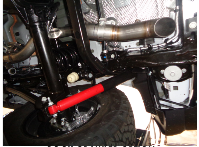
ROCK CRAWLER OPTION

Step 2. Install your new system by first loosely attaching the Inlet Assembly to the DPF with the supplied 2.75" clamp. Engage the welded hanger to the rubber insulator. Keep all clamps loose to allow for final adjustment.