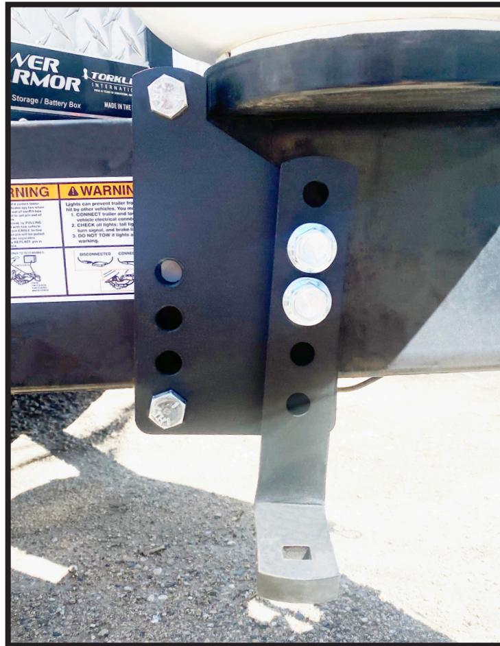
TrackPro & 2-Point Long L Brackets