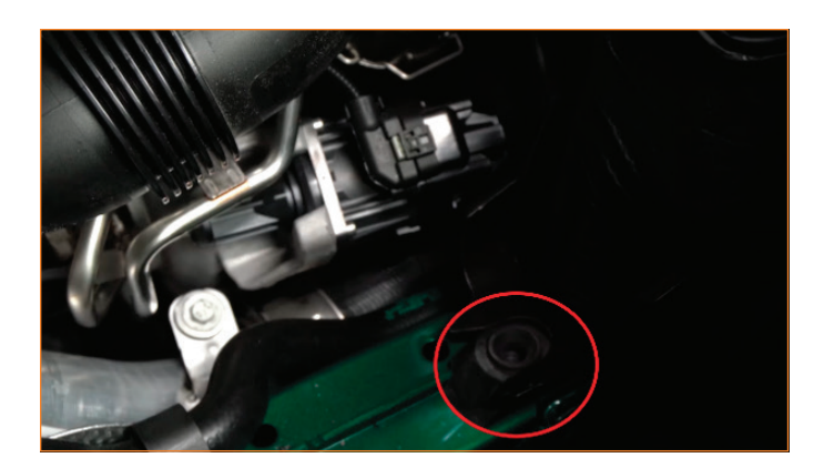
03. Disengage the spring clip on the intake tube, then remove the intake tube from the aluminum turbo snout.