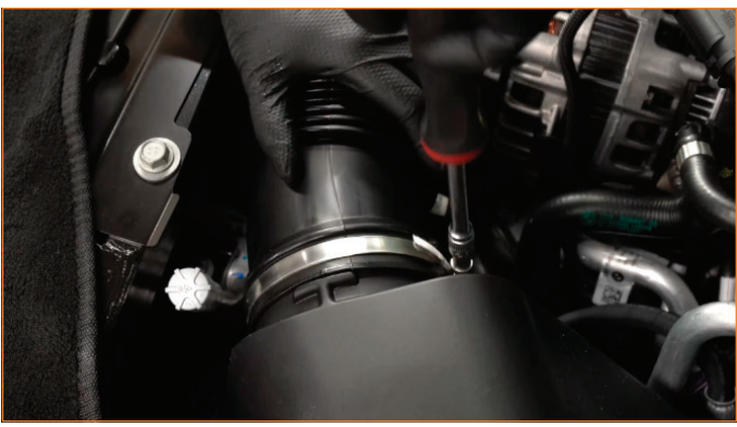
CONTINUED ON FOLLOWING PAGE

Note: If any of the 2x rubber grommets come off with the air box, reinstall them back onto the vehicle.