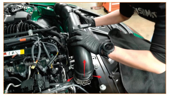
08. Install the Mishimoto aluminum turbo snout on the passenger-side turbo. Fasten with stock hardware.

07. Disengage the spring clip on the driver-side intake tube at the turbo, then remove the intake tube from the plastic turbo snout.