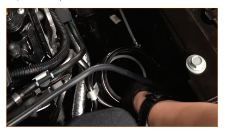
19. Temporarily disconnect the electrical harness shown to gain more clearance when installing the driver-side intake.

18. Install the hump coupler to the CNC adapter with the two 70-90mm worm gear clamps. Tighten one of the worm gear clamps to secure the coupler to the adapter, leave the other one loose.