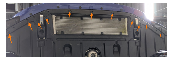
02. Remove the remaining bolts holding the center splash guard and remove. (Image on right)

01. Remove the bolts from the front guard and remove.