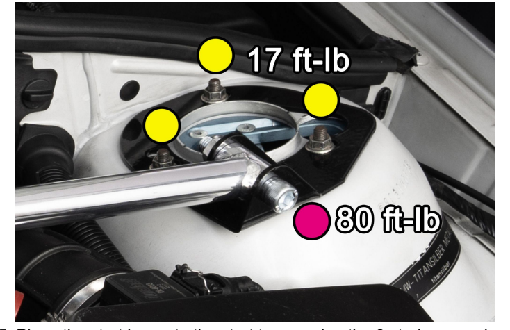
5. Place the strut bar onto the strut tower using the 3 studs on each side to align it into place. Reinstall the 6 nuts that were removed and fasten to 17 ft-lb. Fasten the hardware between the bar and bracket using a 10mm allen key and 18mm wrench and torque to 80 ft-lb.