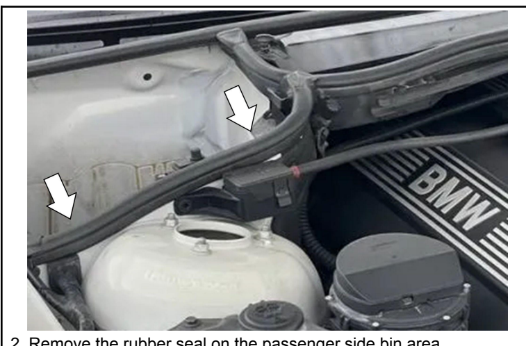
2. Remove the rubber seal on the passenger side bin area.

NOTE: Disconnecting the negative battery cable erases pre-programmed electronic memories. Write down all memory settings before disconnecting the negative battery cable. Some radios will require an anti-theft code to be entered after the battery is reconnected. The anti-theft code is typically supplied with your owner's manual. In the event your vehicles' anti-theft code cannot be recovered, contact an authorized dealership to obtain your vehicles anti-theft code. We also highly recommend NOT discarding any stock parts after the installation.