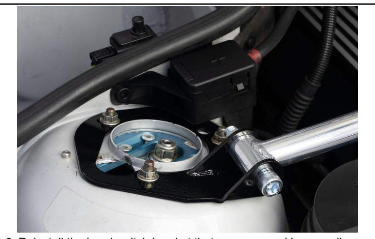
6. Reinstall the hood switch bracket that was removed in an earlier step.