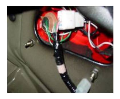
Step 10: Unplug the wire harness from the taillight assembly. Repeat step for passenger side.