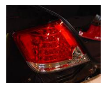
Step 22: Ckeck all before reinstalling the bumper and the hardware.

AnzoUSA™ products are covered, by a limited one (1) year warranty, to be free of manufacturer's defects. However, certain AnzoUSA™ product categories have warranty policies which differ from this standard, please contact your representative for detailed category information. Damage due to improper installation or road hazards is not covered. Seller and manufacturers' only obligations shall be to replace the product proven to be defective. Neither seller nor manufacturer shall be liable for any injury, loss or damage, direct or consequential, arising out of the use of or the inability to use the product. Before using, user shall determine the suitability of the product for its intended use, and user assumes all risk and liability whatsoever in connection therewith.