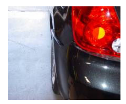
Step 7: Pull the side of the bumper off. Repeat step for passenger side.