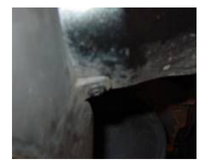
Step 4: Remove the plastic phillip head screw located undernieth the mud guard. Repeat step fpr passenger side.