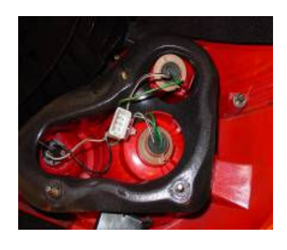
Step 14: Remove the wire hareness from the taillight assembly.