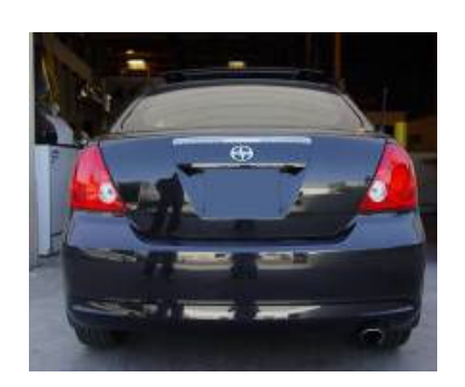
Tools Needed: Flat head screw driver Phillip screw driver 10 mm socket 8mm deep socket 8mm wrench

Description: Tail light Part Number: 321060-321061-321062 Application: 2005-2007 Scion TC