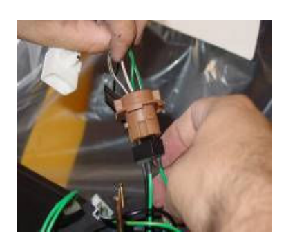
Step 20: Connect the pigtail from the taillight to the stock wire harness. Make sure to match the ground to

Make sure to match the ground to ground.