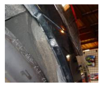
Step 6: Remove the 10 mm. Repeat step for passenger side.