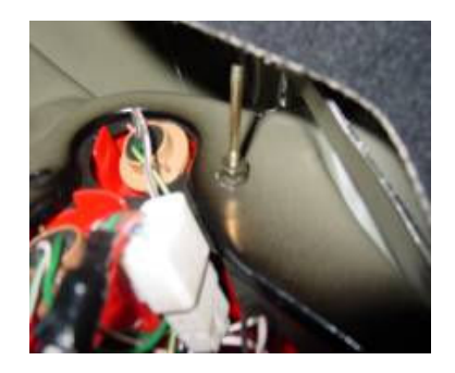
Step 12: Remove the 8 mm nut located at the top of the taillight assembly. Repeat step for passenger side.