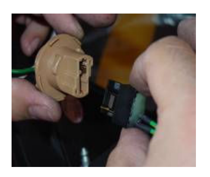
Step 19: Connect the pigtail from the taillight to the stock wire harness.

Make sure to match the ground to ground.