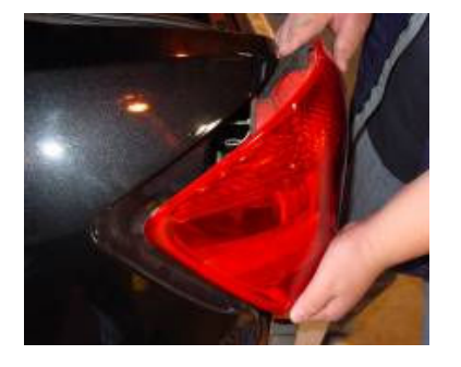
Step 13: pull the taillight stright out.