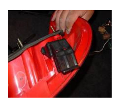
Step 16: Remove the clip located at the bottom of the stock taillight.