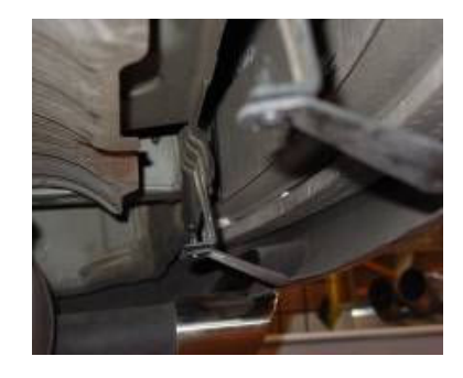
Step 5: Remove the plastic push pins located undernieth the bumper.