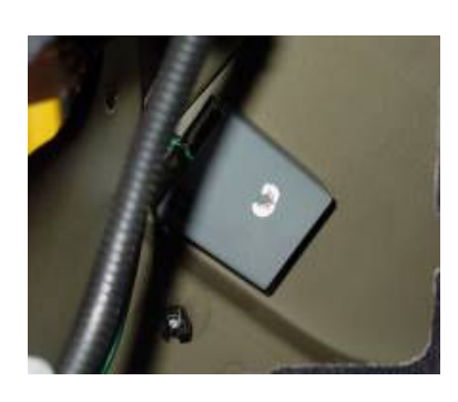
Step 18: Mount the resistor in a safe place were water will not get to it.