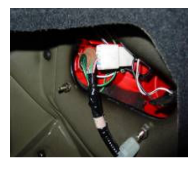
Step 11: Remove the two 8 mm nuts located at the bottom of the taillight assembly. Repeat step for the passenger side.