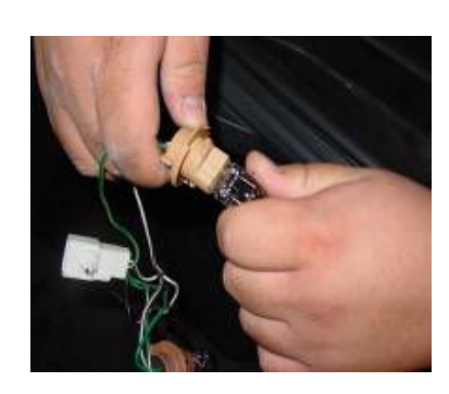
Step 15: Remove the two bulbs from the biege sockets.