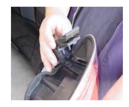
Step 17: Connect the clip to the ANZO LED tailllight.