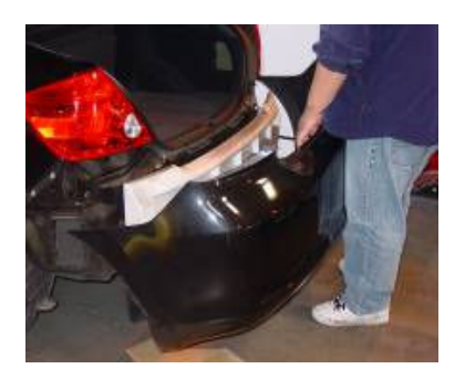
Step 8: Pull the bumper straight out.