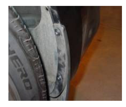
Step 3: Remove the two phillip head srews from the mud guard. Repeat step for passenger side.